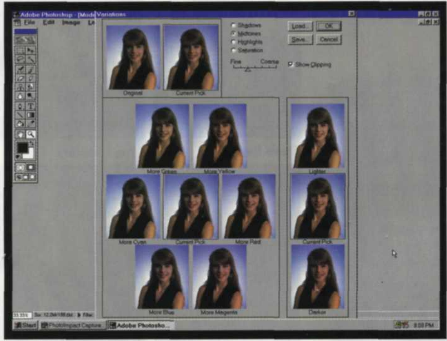
Color balance of 6x4.5 scan in Photoshop.