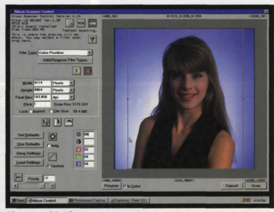
Hi-res scan of 6x4.5 transparency.