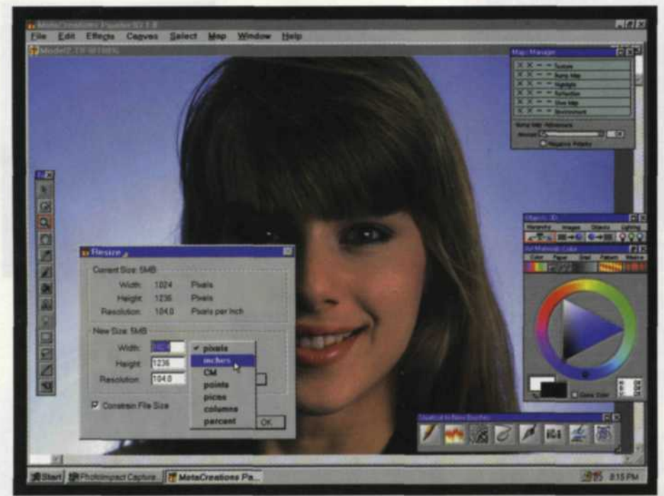
Resize of image in Painter 3D.