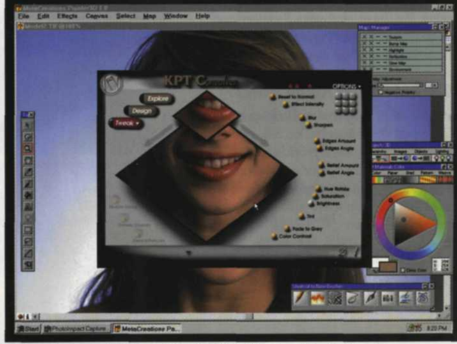
Color adjustment in Painter 3D using MetaCreations Plug-in filters.